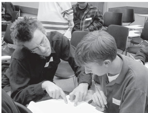
One-on-one interaction is a big part of the Math Circle experience.

The Möbius strip offers a wealth of interesting and accessible problems. This experimentation led to many conjectures. Through identification of sides of a polygon a library of “familiar” surfaces was built: the sphere, torus, and the