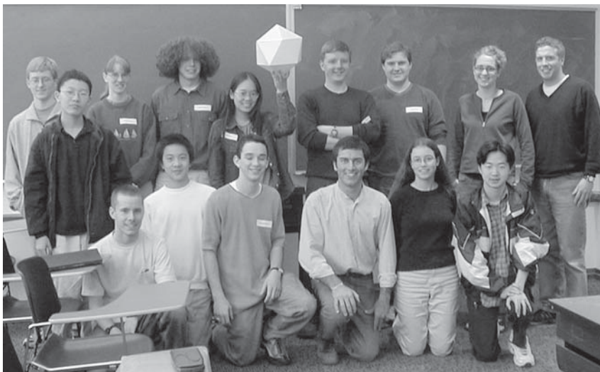
University of Utah Math Circle participants, May 2002.

Math Circle at the University of Utah is a weekly two-hour program for high school (and some middle school) students. The participants are exposed to interesting mathematics or more advanced topics that they would not normally see in high school, and have the opportunity to explore these by working on problems with faculty and graduate students (and each other).