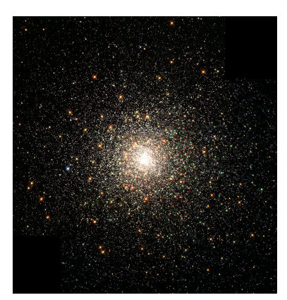
The Messier M80 globular star cluster.